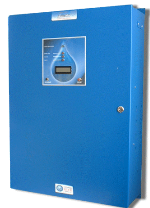
Control panel CP-224

Naturally, the basic model , AQUA-STOP® 3239, stays the reference for single family dwellings. With the flexible detectors included, most houses are allowed to get the protection for all the appliances being the cause of a flood: Washing machine, hot water tank, dishwasher toilet, sink etc.