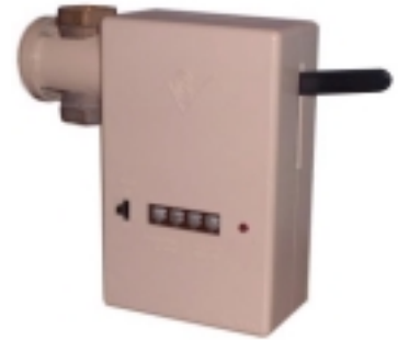
AQUA-STOP® models 3239, 341

Take a few moments to figure out why the combination of our CP-224 with the automatic valves AQUA-STOP® model 341-SV will represent the best solution for your installations.