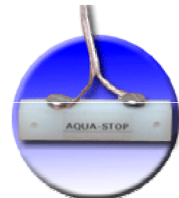
Solid detector. model DS2